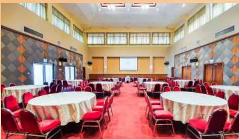
Multi-purpose Hall, Banquet Hall, Auditorium, Meeting rooms, Atrium