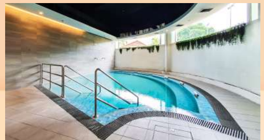
Members can make use of the gym to keep themselves fit and healthy or relax in our spa pool located in the male and female changing rooms.